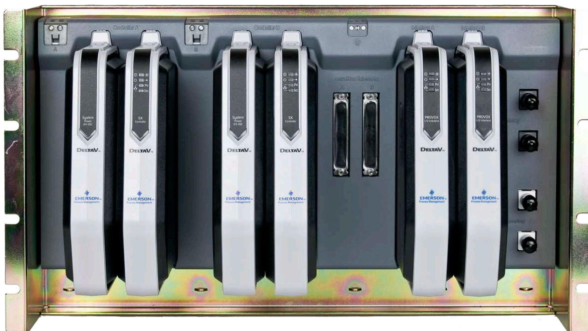
The S-Series DeltaV Controller Interface for PROVOX I/O.